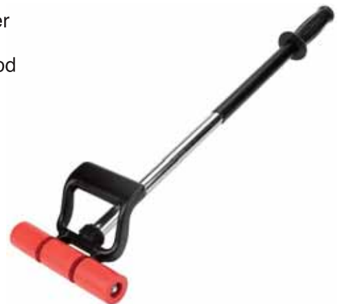
Figure 2 . Pressure roller with rod