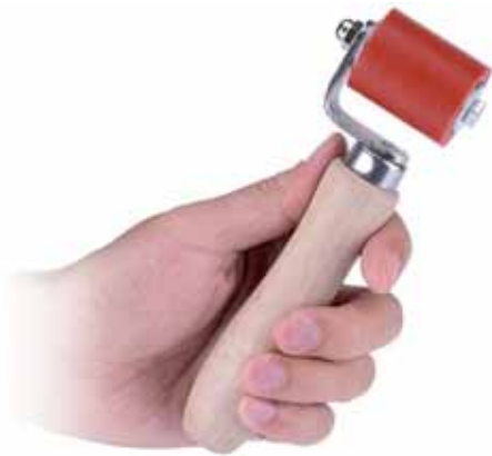
Figure 1 . Manual pressure roller